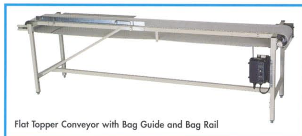
Flat Topper Conveyor with Bag Guide and Bag Rail