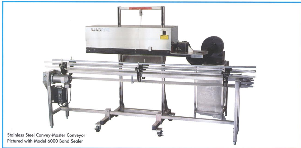
Stainless Steel Convey-Master Conveyor Pictured with Model 6000 Band Sealer

See reverse side for complete list of specifications.